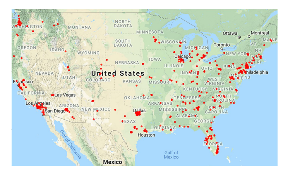
Fig. 2 Residential distribution of the respondents

Since our survey was concerned with driving a personal car, and due to human subjects protocols, we only allowed respondents over 18 to participate. A comparison of socio-demographic characteristics between our sample and the US adult population ( \geq 18 years old) is presented in Table 2. As can be seen, males, people in the range of 18–25 years old, and those with mid-level household income ($ 30,000–74,999) were overrepresented in our sample, while seniors ( \geq 65 years old) and people with high-level household income ($100,000 and above) were underrepresented. Employment is also slightly overrepresented in our sample, and it was shown that the sample contained more people with higher education levels compared to the national population.